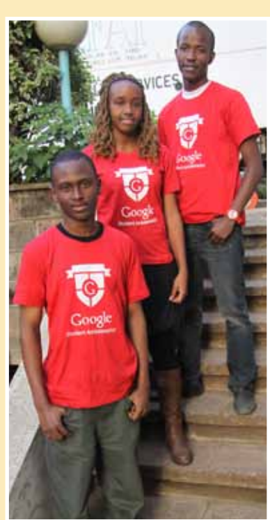
UoN students who also double up as Google Ambassadors.