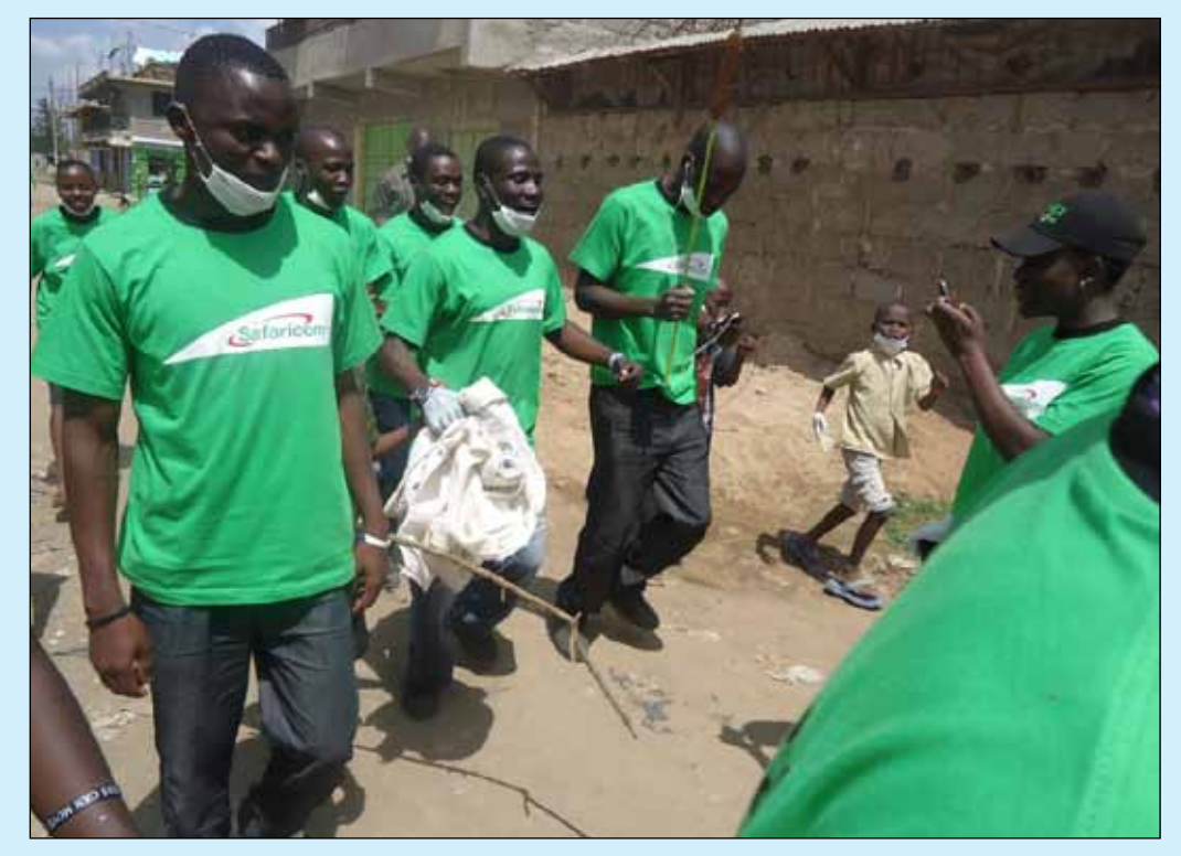
Students during a cleanup campaign.

There is still a greater focus on Module 1 students who readily receive information and varied services from this office. Students in other modules do not readily receive this information and are not often aware of the existence of services offered by the office of the Dean of Students. There is need to increase the number of materials published and further post information concerning this office and its services on the University website.