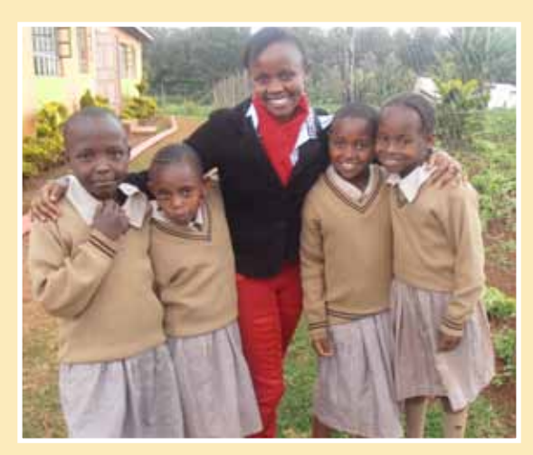
Some of the pupils tutored by members of the Psychology Club.