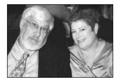
\mathbf{W}e 've never handled money well at all. I guess that's a bit of an understatement—we've filed bankruptcy three times!

The first time we filed, we felt like bankruptcy was our only option. Our small-business loan to buy a body shop went from 4% to 22% APR, and we lost all our earnest money. Soon after, my husband had his first heart attack, and other problems seemed to pile on. Before long, we lost our house and cars. We moved to a different state with four kids, two cats, a dog, a motorcycle, a U-Haul trailer, $800—and no jobs.