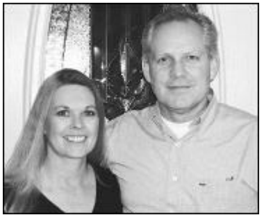
{f B} efore getting onboard with Dave's plan, I was so stressed with work and our financial

The big question is, what do millionaires do? They don't get rich with free hats, brownie points, air miles, and the use of someone else's money. What do broke people do? They use credit cards. An American Bankruptcy Institute study of bankruptcy filers reveals that 69 percent of filers say credit-card debt caused the bankruptcy. Broke people use credit cards; rich people don't. I rest my case.