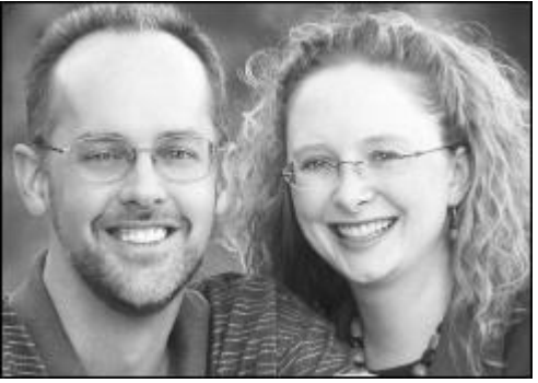
Looking back, we were your typical American family: making good money, having lots of nice toys, and drowning in debt. We always told ourselves we deserved new cars and we needed a house so we could stop paying rent.

An interesting footnote about how healing can occur on your weak spot: I was so disgusted with myself when I woke up and realized the depth of my stupidity that I swore off my drug, cars. I went to abstinence, meaning I didn't care what we drove or what it looked like as long as we were winning in our Total Money Makeover. Fast-forward fifteen years. We had become wealthy again, and I decided to get a different car. I'm always looking for a one- or two-year-old car, I'm always paying cash, and I'm always looking for a deal, not really caring what car it is. I was kind of looking for a Mercedes or a Lexus, but I was really looking for a steal. A friend in the car business called me with a deal—on a Jaguar. So all those years and tears later, when it was no longer the driving force of my approval rating, God allowed a Jaguar back into my life. He returned what the locusts had eaten, but He only did so when it was not my idol. Rumor has it that God doesn't like us to have other gods in our lives.